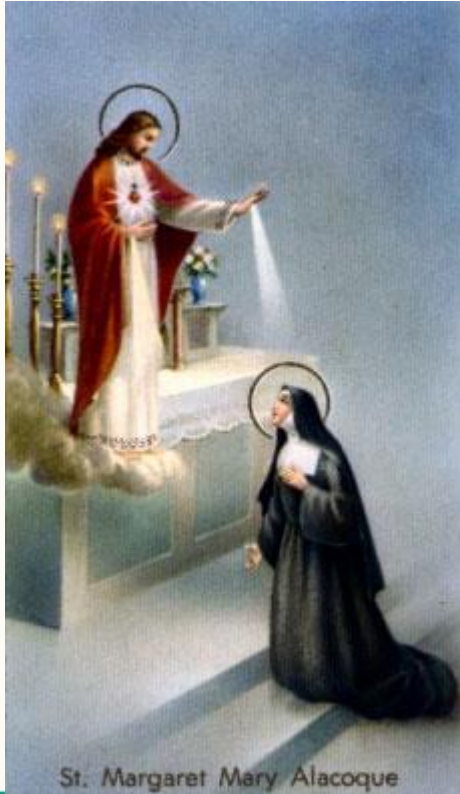
St. Margaret Mary Alacoque